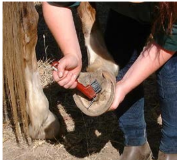
1. Clean your horse's hooves using the hoof pick and brush