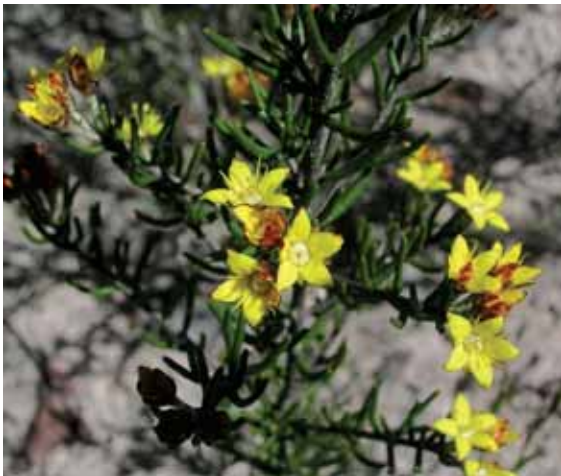
Close-up of Lowan Phebalium flowers.