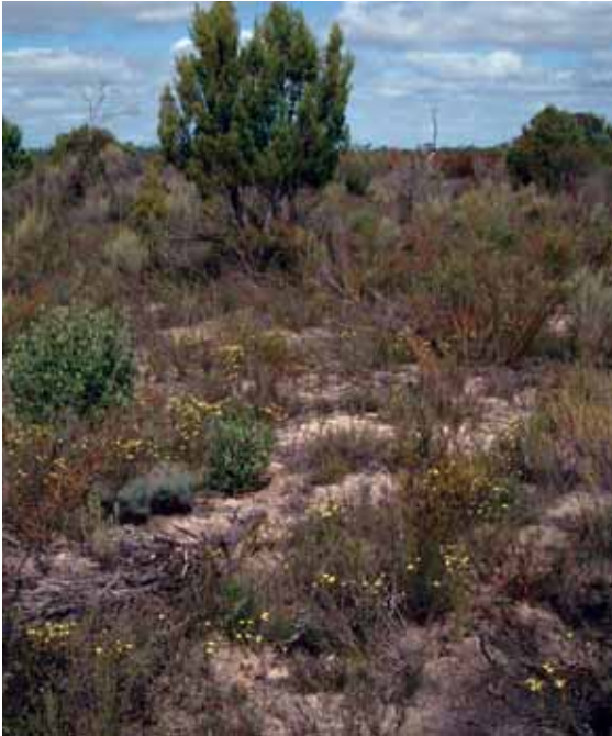
Lowan Phebalium growing in an open shrubland habitat.

Lowan Phebalium occurs in open shrubland and low open woodland communities.