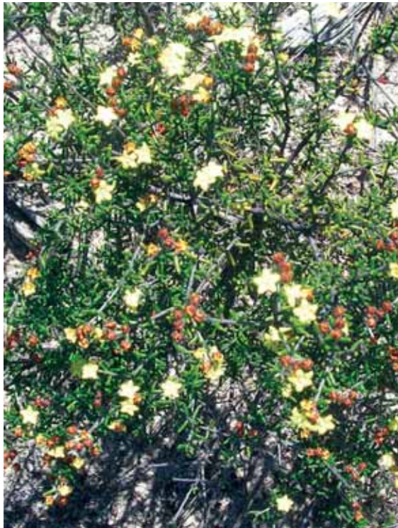
Lowan Phebalium plant in flower.